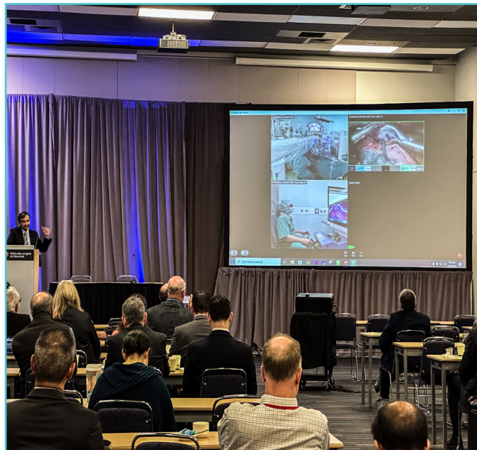
Senhance live surgery transmission with Senhance Connect

Most healthcare professionals collaborate digitally on a regular basis. To facilitate telecollaboration, Asensus complements its digital surgery portfolio with the introduction of Senhance Connect.